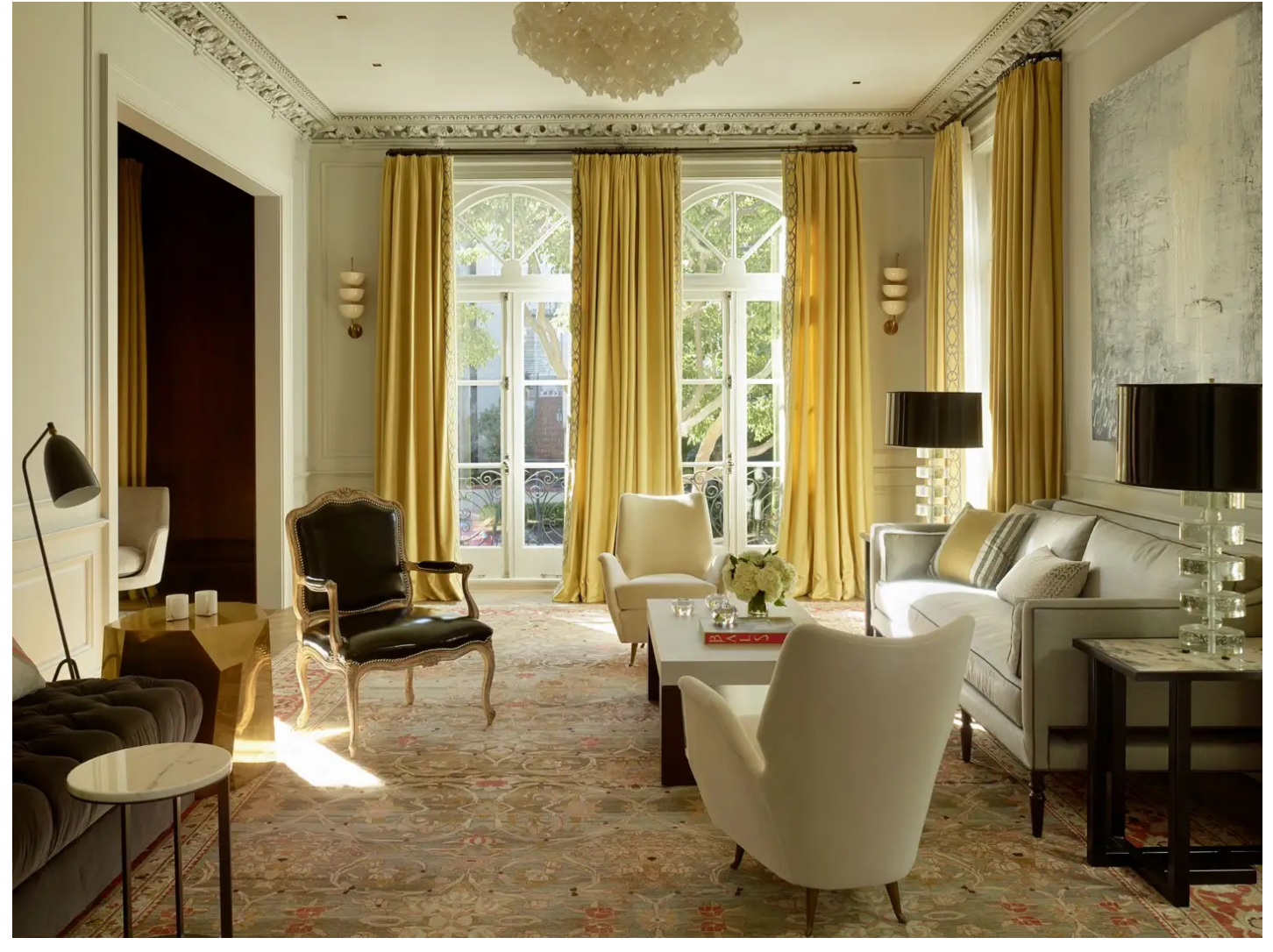
In the living room of the same 1923 house, a Regency sofa and a pair of <u>GIO PONTI</u> lounge chairs surround the coffee table. A faceted brass side table from <u>SCALA LUXURY</u> enhances the room's golden glow.